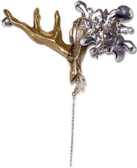
Vintage One Brooch: 130 Euros