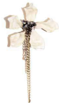
FLOWER Three Earring 450 Euros