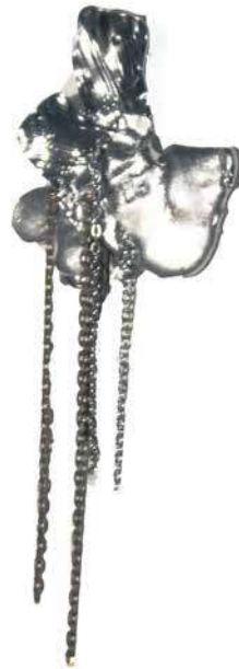
Vintage Twenty One Earring: 105 Euros