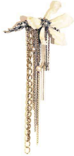
FLOWER Six Brooch 485 Euros