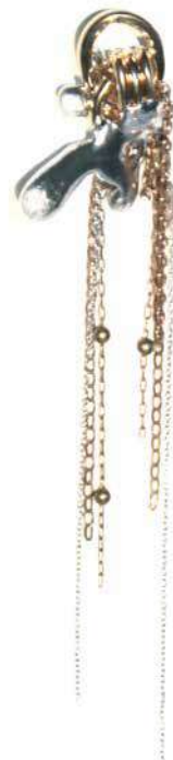
Vintage Twelve Earring 95 Euros