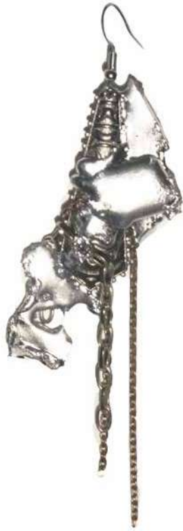
Vintage Twenty Three Earring: 105 Euros