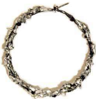
RING One Earring 120 Euros