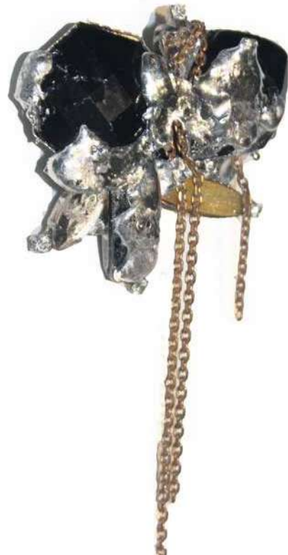
Vintage Four Brooch: 125 Euros