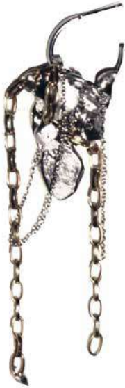
Vintage Seventeen Earring 95 Euros