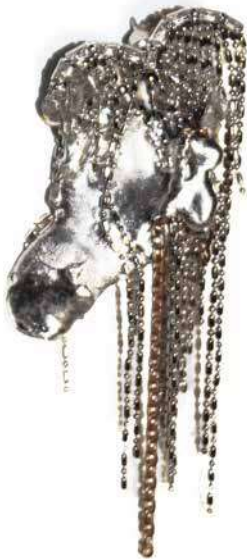
Vintage Twenty Earring: 90 Euros