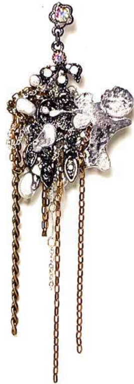
Vintage Six Earring 115 Euros