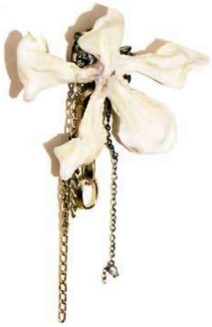
FLOWER One Earring 420 Euros