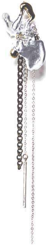
Vintage One Earring 115 Euros