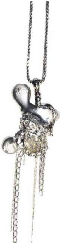
Vintage One Necklace: 120 Euros