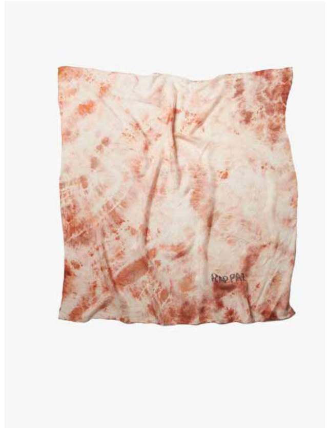
Silk Scarf Tie and Dye, 90 x 90 cm, France, Unique pieces: 140 Euros