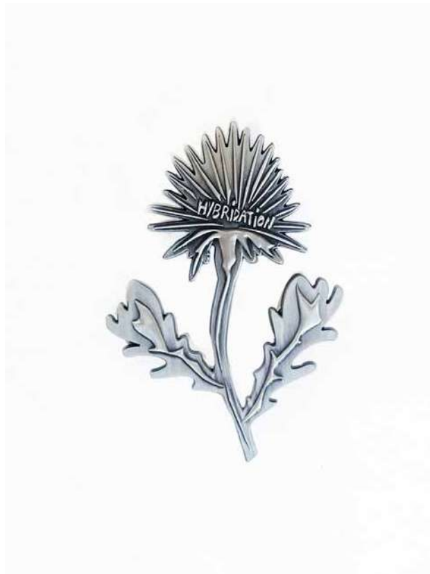
Pin's One: 40 Euros