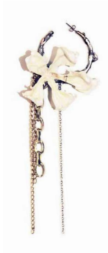
FLOWER Two Earring 480 Euros