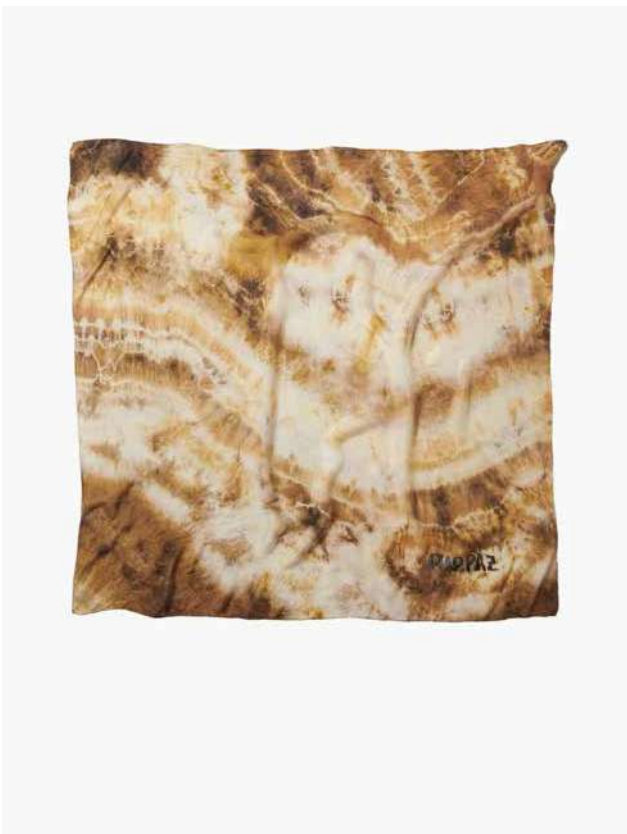
Silk Scarf Tie and Dye, 90 x 90 cm, France, Unique pieces: 140 Euros