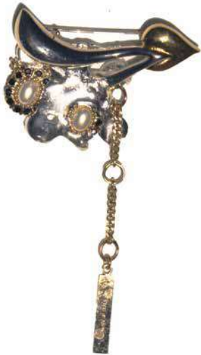
Vintage Three Brooch: 115 Euros