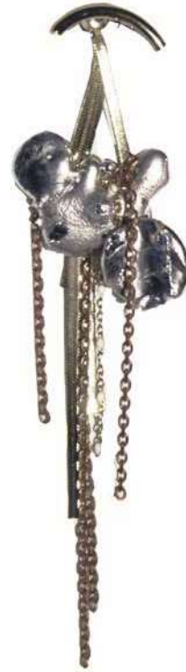
Vintage Nineteen Earring: 105 Euros