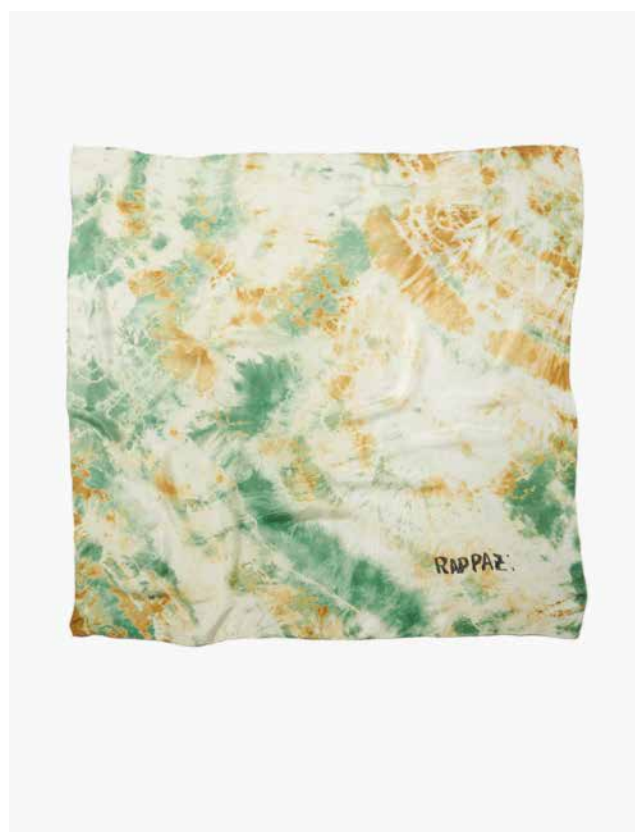
Silk Scarf Tie and Dye, 90 x 90 cm, France, Unique pieces: 140 Euros