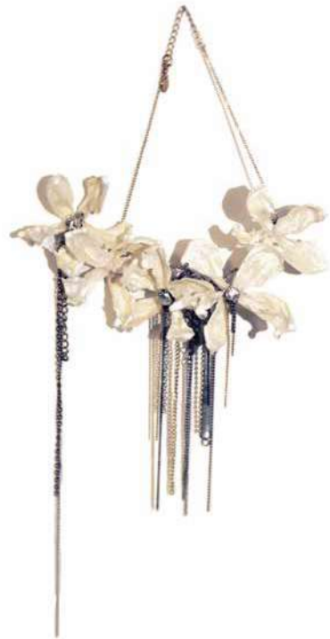
FLOWER Eight Necklace 670 Euros