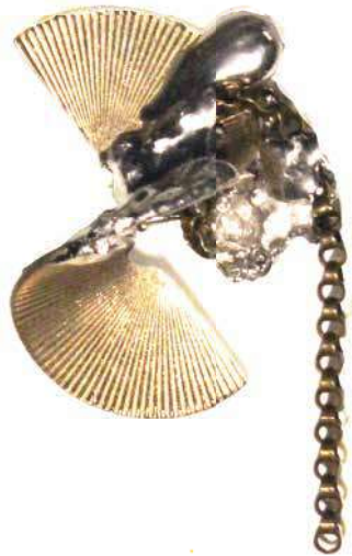
Vintage Nine Earring 125 Euros