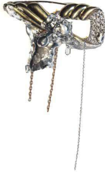
Vintage Two Brooch: 115 Euros