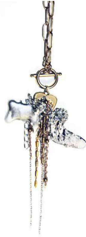
Vintage Two Necklace: 120 Euros