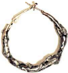
RING Three Earring 100 Euros