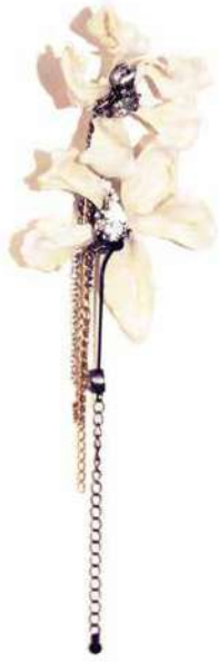
FLOWER Five Earring 495 Euros