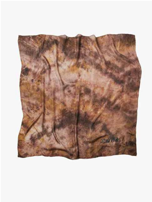
Silk Scarf Tie and Dye, 90 x 90 cm, France, Unique pieces: 140 Euros